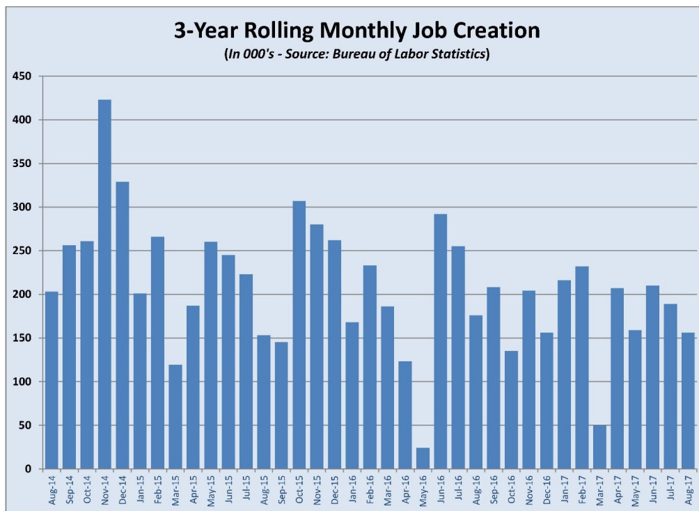
(job creation history) While August's hiring report was slightly below expectations the monthly average of 177,000 jobs created is running above forecasts for 2017.